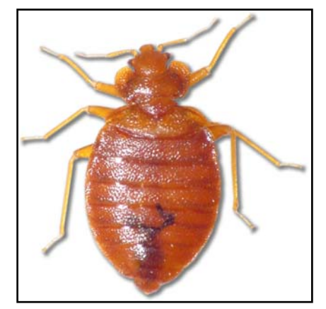
The Common Bed Bug, Cimex lectularius ~5mm